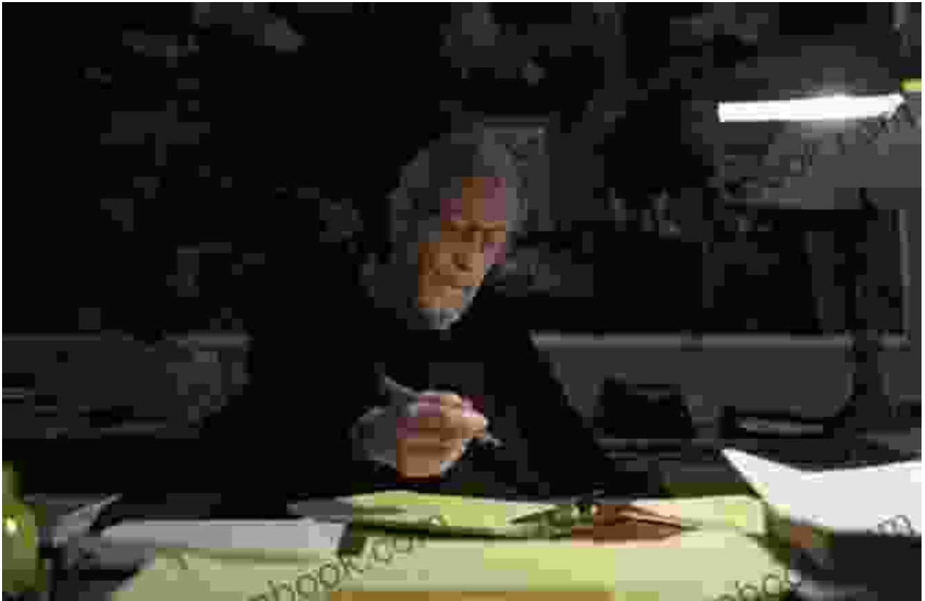
Elmore Leonard working on one of his many novels

Known for his distinctive style and dialogue, Leonard emphasized the importance of authenticity. "I try to write the way people talk," he said. "I want my characters to sound real." His characters were often flawed and complex, with their own unique quirks and motivations.