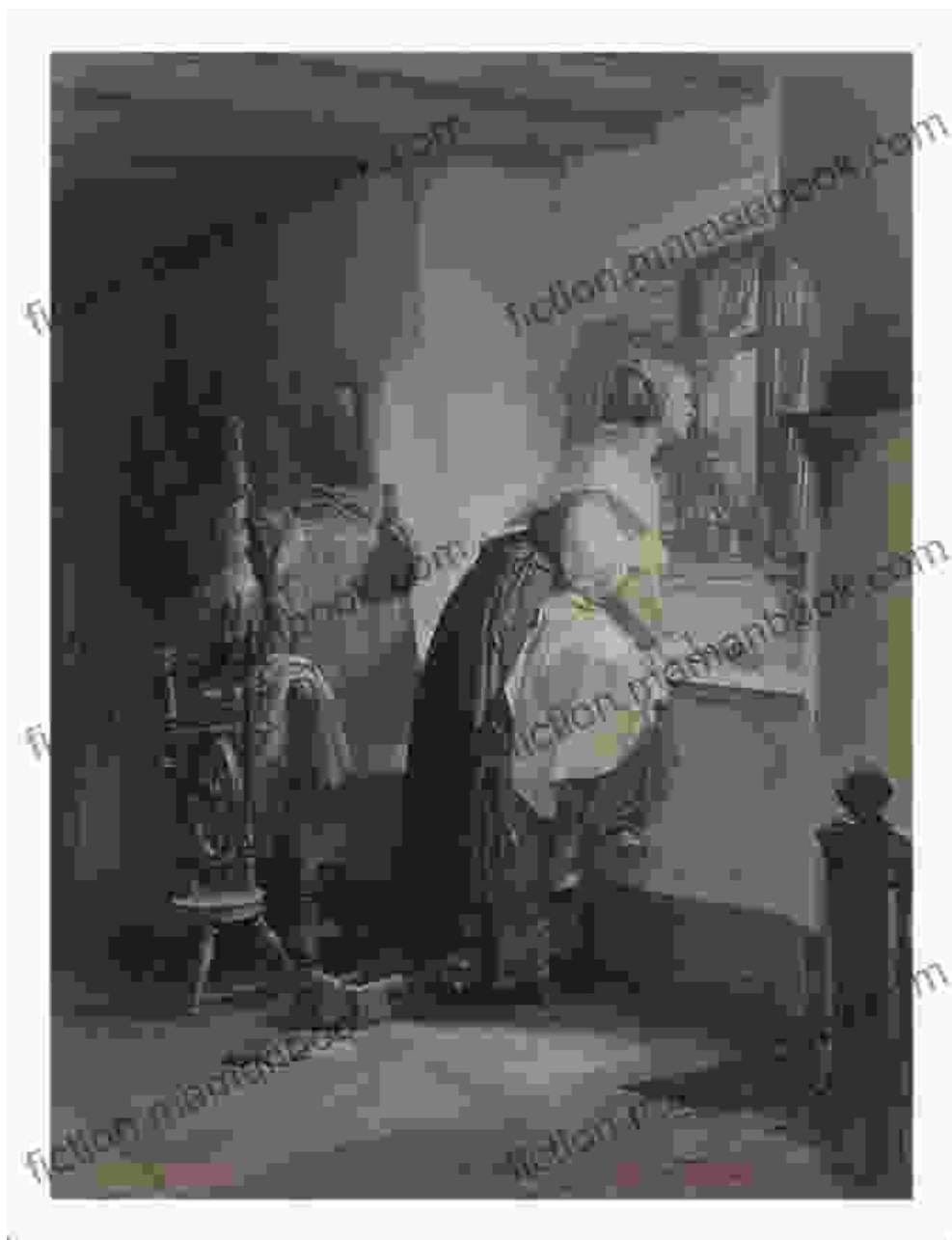
The Witch's Kitchen by August von Kreling