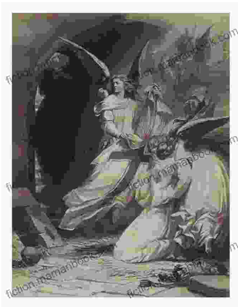
Gretchen's Salvation by August von Kreling